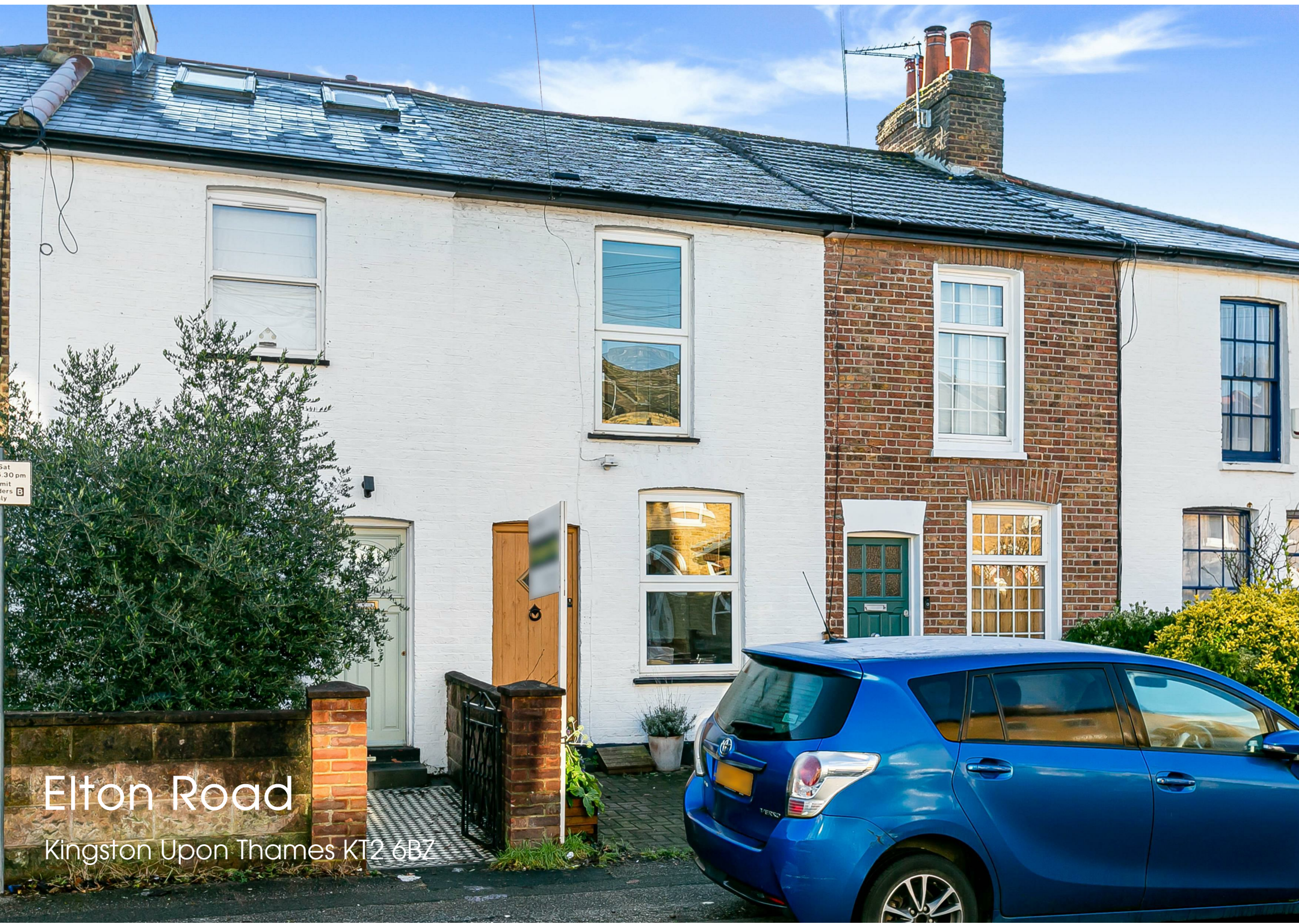
Elton Road Kingston Upon Thames KT2 6BZ